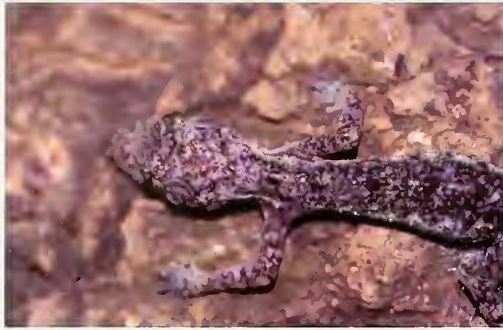
Fig. 9. Hemidactylus ansorgei from Lama Forest (Noyeau central), first country record.